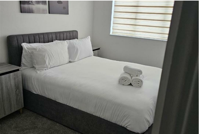
APARTMENT (EPC RATING: D)